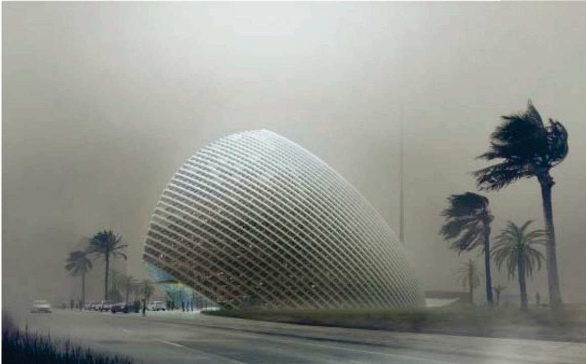
Algeri_Render Post Dust Storm_by MIR